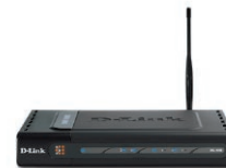
DGL-4300 Wireless 108G Gaming Router

Other D-Link products that work with the DSM-520: